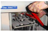
manually by hand crank